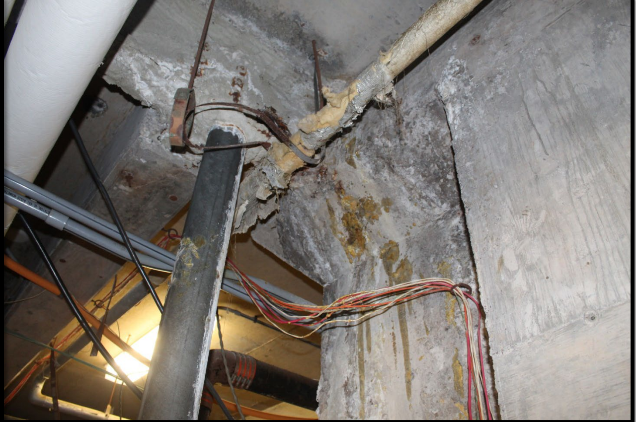
BHS Pool Cont.